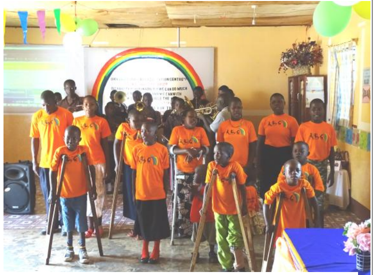
Children entertain visitors with a brass band from Zigoti ( a Chance For Children) , a partner Organisation with NRC.