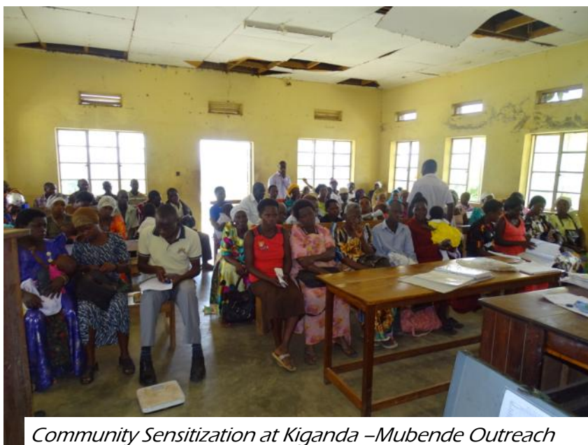
Community Sensitization at Kiganda –Mubende Outreach

We are seeing a great change in people's attitude towards people with disabilities in our areas of work.